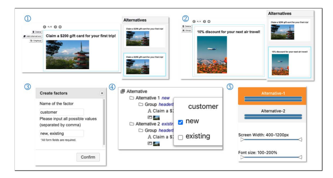
Fig. 5: Creating alternatives in DocDancer . (1) Create content for new customers and add alternatives. (2) Create content for existing customers. (3) Input names and options of responsive factors. (4) Bind different options to different content: for customer = new , show the gift card offer; for customer = existing , show the discount offer. (5) Both alternatives are active on all font sizes and screen widths, so which alternative is shown depends only on the customer variable.

tools. Following the study, participants completed a survey and engaged in a semi-structured interview. Each session lasted approximately 1.5 hours, and participants were compensated with Amazon gift cards ($15/hour). All participants completed both tasks with minimal guidance.