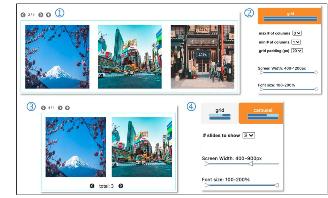
Fig. 3: Responsive pattern recommendations for a group of three images. (1) Recommended grid pattern. (2) Adjustable parameters for the grid. (3) Recommended carousel pattern. (4) The group applies responsive patterns based on screen width: screen width = 900-1200px: grid; 400-900px: carousel.

We recruited 16 participants (8 females, 8 males), including 6 professional designers and 10 students in design-related