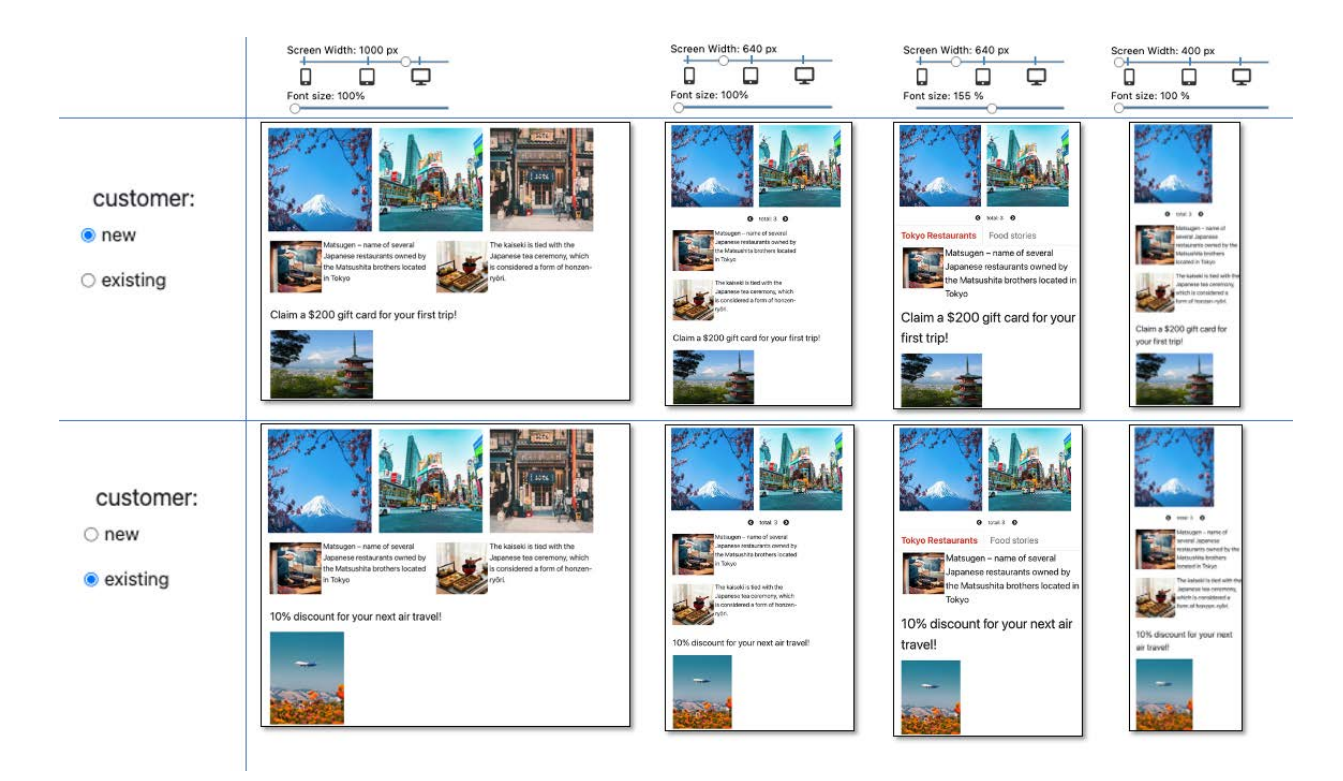
Fig. 1: Previews of an ultra-responsive document showing eight different versions of a marketing newsletter with adaptive layouts and contents designed for different screen widths, font sizes, and customer types.